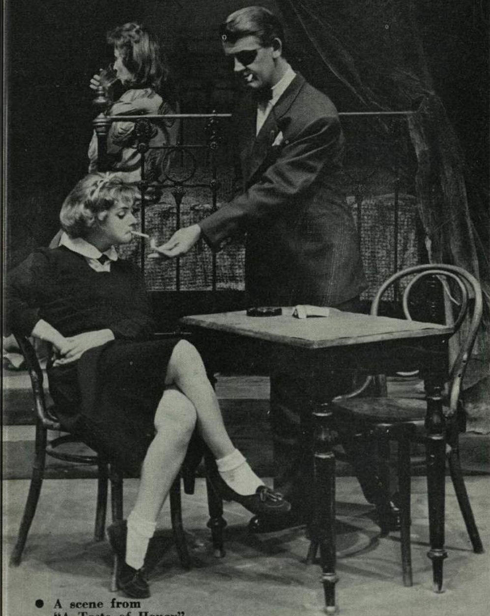
● A scene from "A Taste of Honey" Union Theatre Repertory Production